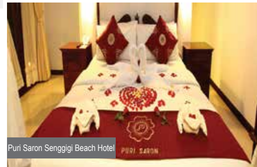
Puri Saron Senggigi Beach Hotel